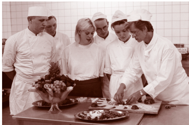
In the training kitchen of the Vocational Training Centre for Crafts and Commercial Occupations – International Union – trainees have the chance to put their theoretical knowledge into practice

The next innovative advance for “training in occupations” was aimed directly at improving training quality. It brought new training models, new forms of learning and new training methods. The system of recognised training occupations now followed a skills concept that supplemented competence in the subject with method competence and social competence. The necessary consequences for examination practice, however, were not drawn. 3 The examinations in vocational education and training remained limited to their traditional structures and forms. They covered practical skills and theoretical knowledge but not thinking and acting with an orientation towards the work process.