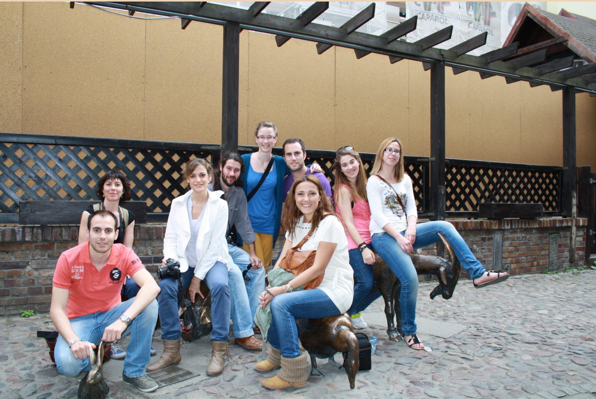
Work placement students in Wrocław