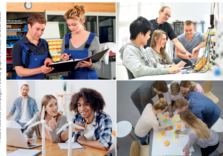
Picture sources (title page): Fotolia, graphic (inside): Shutterstock

Possible approaches and guidelines for implementation